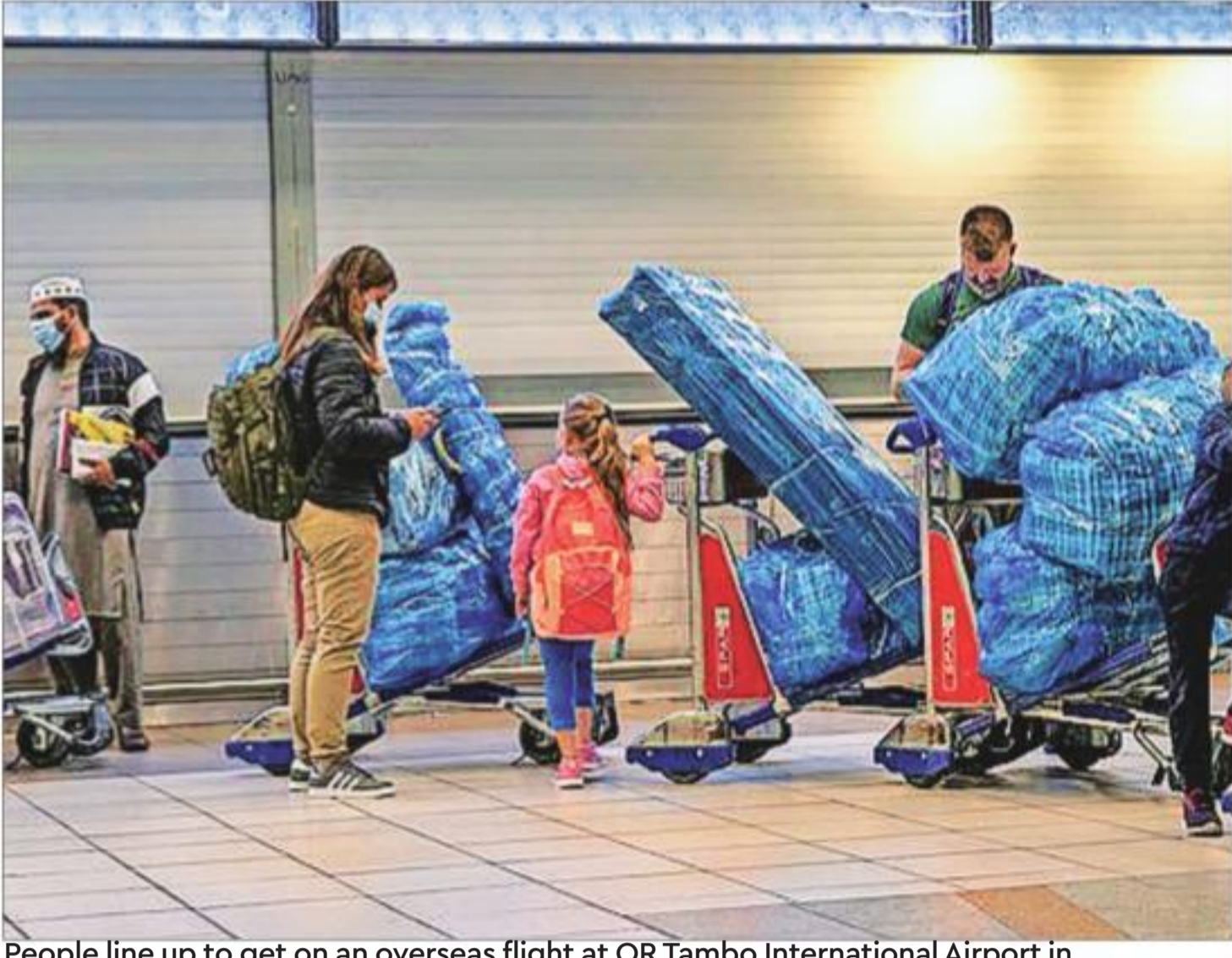
People line up to get on an overseas flight at OR Tambo International Airport in Johannesburg, South Africa

With so much uncertainty about the variant and scientists unlikely to flesh out their findings for a few weeks, countries around the world have been taking a safety-first approach, in the knowledge that previous outbreaks of the