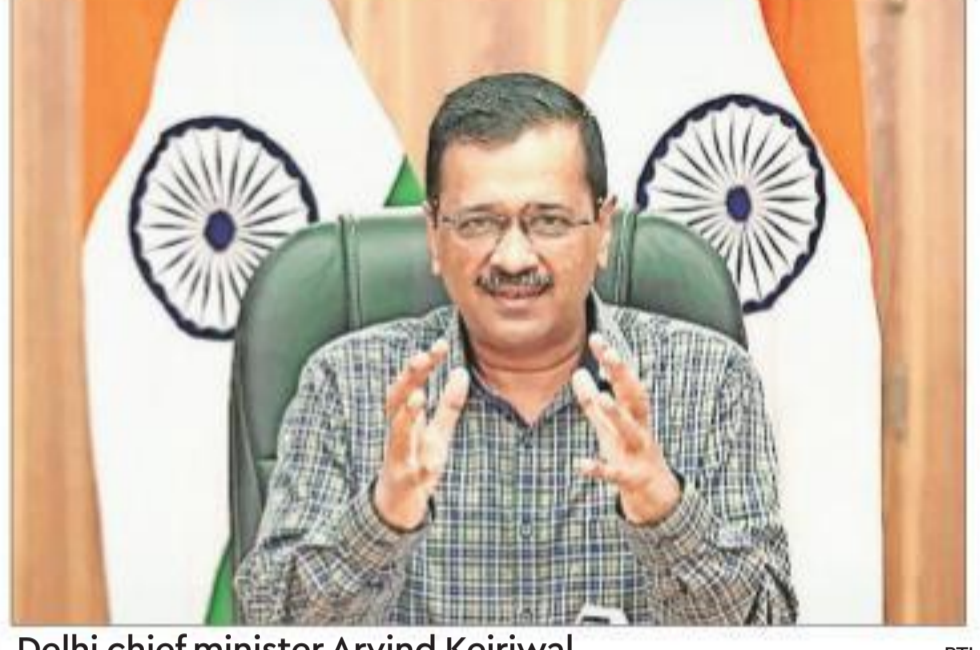
Delhi chief minister Arvind Kejriwal

The meeting comes amid rising global concerns over a new strain of the Coronavirus which the World Health Organisation has named 'Omicron' and classified as a highly transmissible virus of concern. The cumulative number of Covid-19 vaccine doses administered in the country has crossed 120.96 crore, according to the Union health ministry.